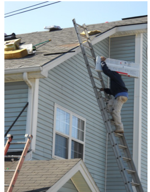
For the crew at Clyde's Roofing it's all in a days work.

on both planned and unplanned repairs and renovations. Our building itself has been called home by 150 different individuals since its opening in 2008. We have to keep our facility in top shape so that hundreds more have the opportunity for a fresh start and a place to call home.