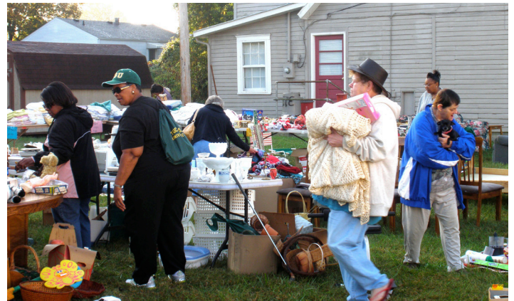
There is nothing more fun than a yard sale on a crisp fall day

They say one man's trash is another man's treasure. Well, there were over $500 worth of "treasures" that people bought at our recent yard sale, held in conjunction with the South Frankfort Neighborhood Association. Fund raising was one goal of the enterprise; clearing out our storage units was another.