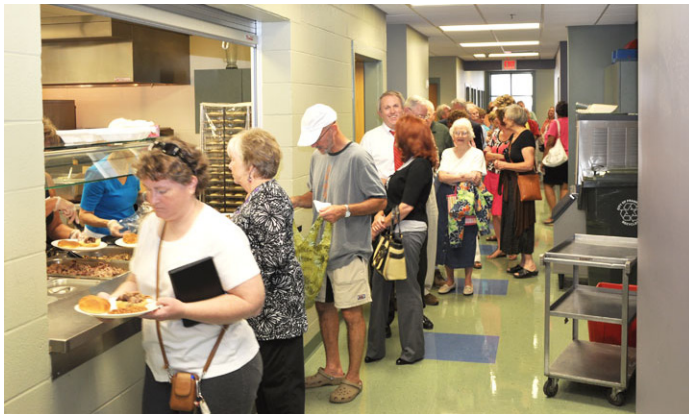
Over 500 people came to the BBW Supper

On August 22, 2011, the third annual Sumptuous Southern Supper fed and entertained over 500 people, the largest crowd to date. The menu included: pulled pork, chicken, veggie burgers, red potato salad, baked beans, cole slaw, brownies, and caramel pie. Staxx BBQ catered the main dishes, while O'Charley's donated the rolls and caramel pie. Drinks and brownies were provided by the Brainy Bodacious Women.